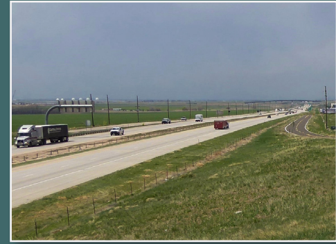
I-70 | Harvest Road